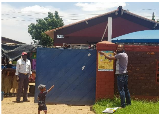
Neighbors of a case sticking the received posters on the wall and gate of their property.

being distributed, there is a clear request for more information.