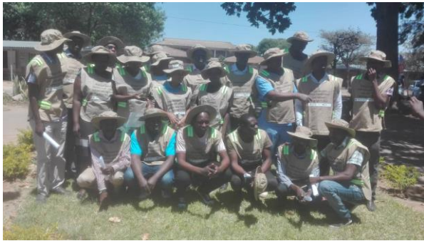
Environmental Health Technicians of Glenview and Budiriro CTCs teams with visible hats and jackets

which are the most likely to have regular contact with the case.