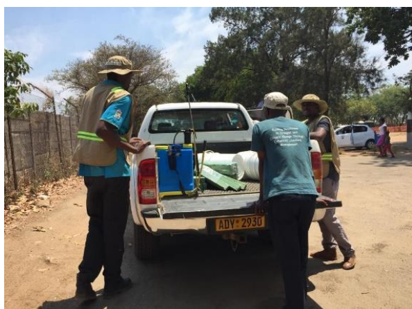
Budiro teams loading car before intervention

To ensure a regular communication between team leaders, a decision was taken to create a